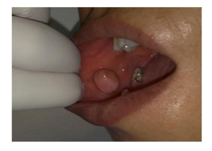
Fig. 2. Fibroma on right side of buccal mucosa.

Diode laser (Diomed 15 laser) was used for oral surgical procedures. It is an integrated GaAlAs semiconductor laser. Its maximum output power is 15 W and it works in continuous, single, and repeated pulsed modes. Its wavelength is 810 nm, and the pulse duration is 0.1-1.0 second.