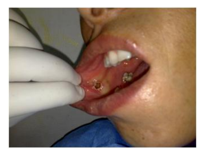
Fig. 4. Complete fibroma excision by 3 W, continuous & contact mode surgical diode laser.