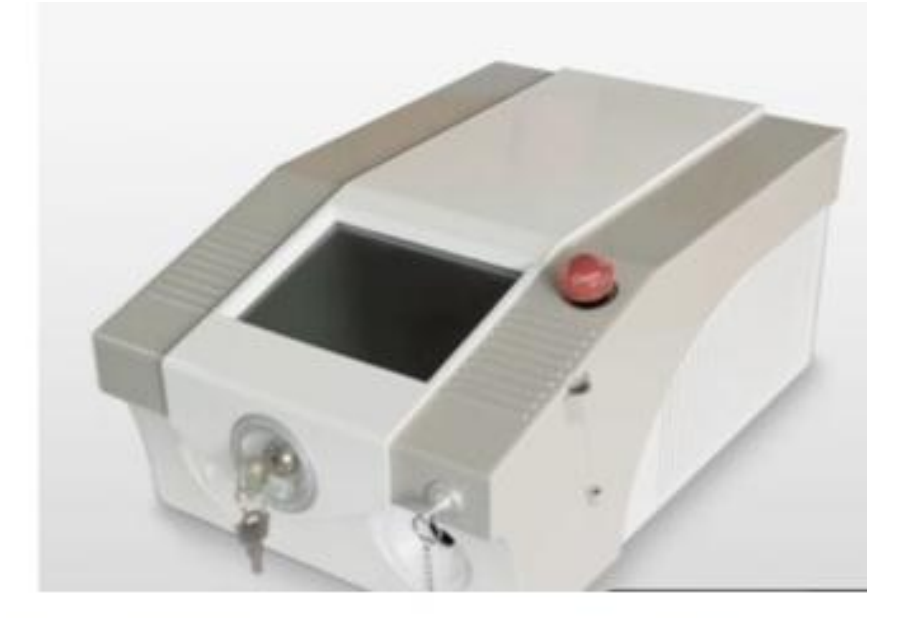
Figure 1. 30 W DIODE laser surgical machine

about all details of the procedure and informed verbal consent was obtained from each patient prior to operation. All operations were conducted by the same single surgeon.